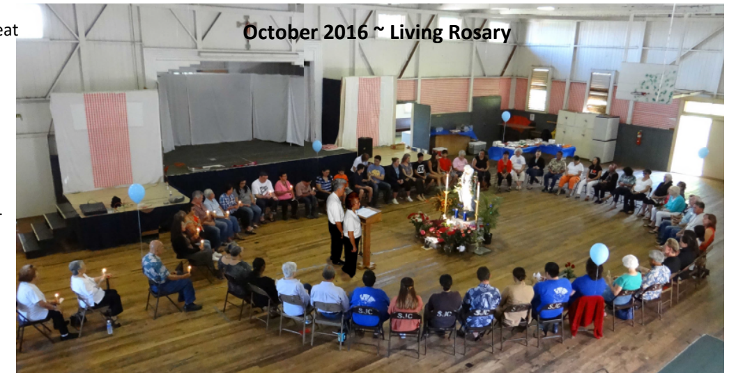
October 2016 ~ Living Rosary