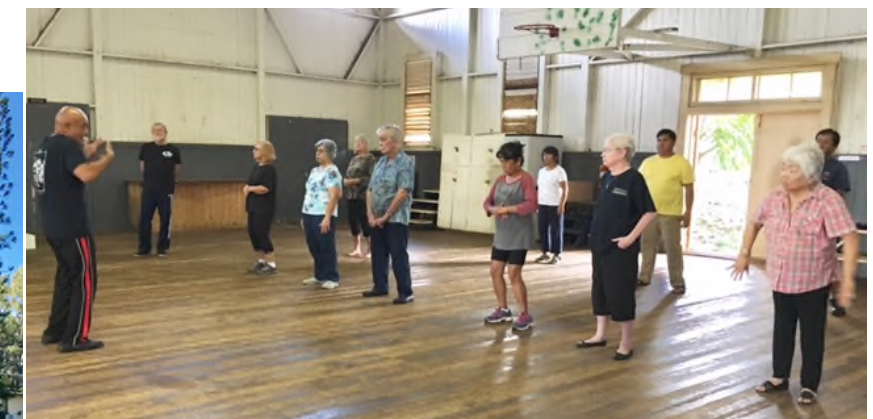
Health, Wellness & Fellowship

Parishioners continue to meet for Tai Chi, Walk Fit and Imago Christi Healing Prayers. These ongoing activities resulted from the June/July Social Outreach Ministry "Health, Wellness & Fellowship" offerings of healthy lifestyles for the body, mind & spirit.