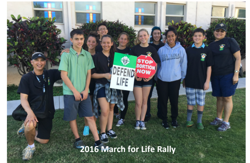
2016 March for Life Rally